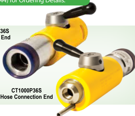
CT1000P36S Hose Connection End